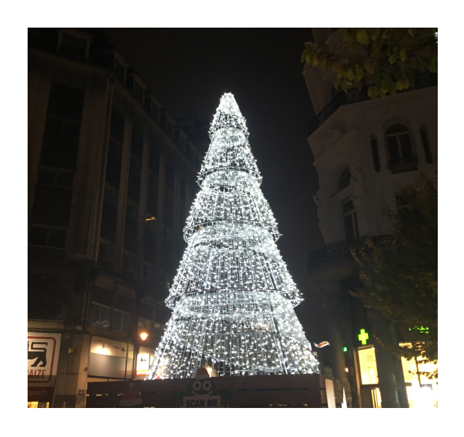
The only thing missing here are Santa's reindeers

In December we remember all things tender