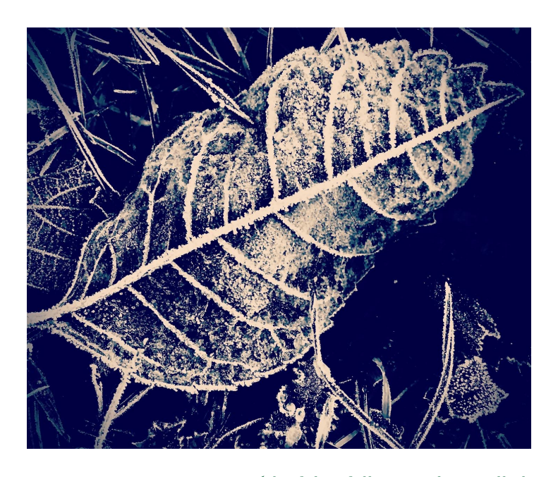
A leaf that falls, can't be recalled from high to low a new one grows It's made out of what's left untold On paper, still to unfold

Not all is lost That past in dust, A lot it cost