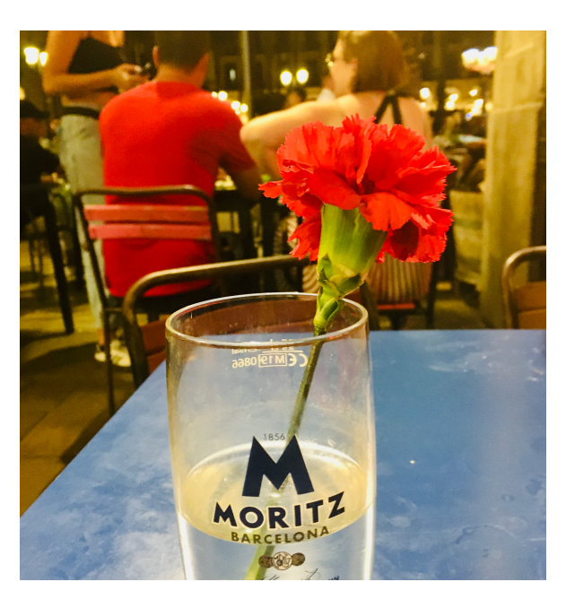
No potion can chase service and devotion

and in re-in-carnation she will look twice as nice